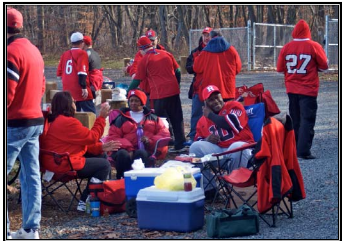
Touchdown Club members relaxing before the UCONN game