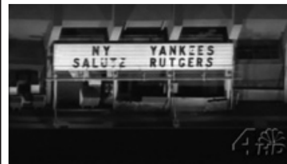
NY Yankees recognize RU victory over Louisville

Go Rutgers!! Keep the magic going in the 2006 season!!!!