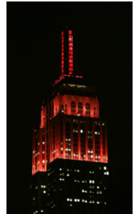
The Empire State Building cast a scarlet glow across Manhattan for the Louisville game